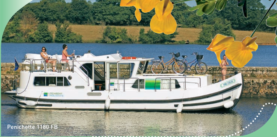
Penichette 1180 FB