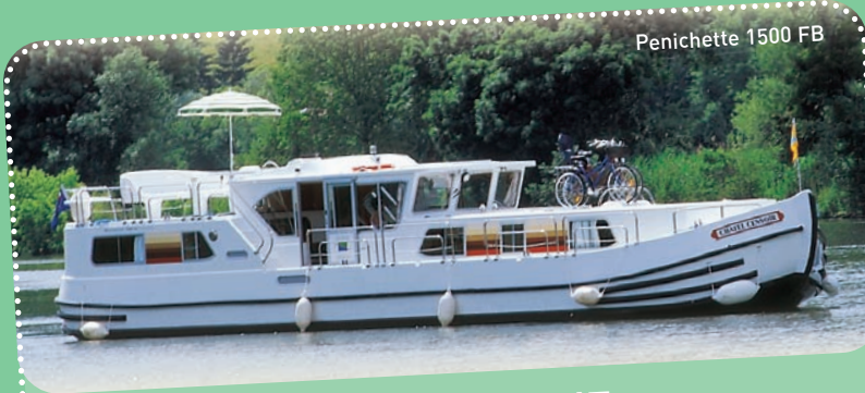
Penichette 1500 FB

For 32 years now, Locaboat has been designing, building and updating the Pénichettes®. Our fleet of comfortable and easily-handled craft undergo a continual programme of maintenance and improvement. More than 400 Pénichettes® now cruise the waterways of Europe: whether for a couple, for a family or for a group of friends, there is always a Pénichette® model to take you in comfort wherever you will. As part of their continual maintenance and improvement, our Aft-Deck and Classic Penichettes return to our factory for a complete refit, during which the technical equipment is upgraded to newer, better performing and more environmentally friendly versions. These boats are then given an "R" logo to signify their Renovation. These boats have a Radio/CD and bike rack, as for the Flying Bridge boats. After a number of years these "R Penichettes" lose their logo and become once again standard Pénichettes.